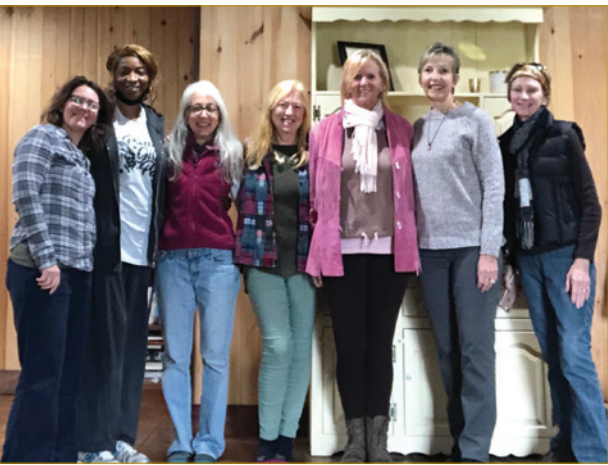
Animal Reiki I & II.