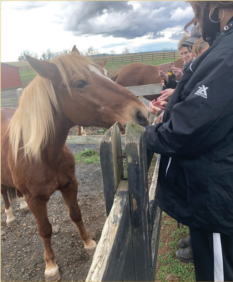
Ace says thank you to all.

T HE 25-YEAR-OLD pony named Ace walked stiffly across the small paddock where six of us stood offering him Reiki. During the session, in which he let us know he was receiving the energy by blowing, stretching his head and neck downward, softening his eyes, swishing his tail gently, and periodically turning his head sideways to look at us, he never moved from his spot on the other side of the paddock. Despite the space between us, we all felt the