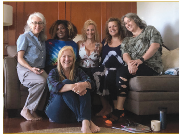
Animal Reiki I & II in June.

training for since 2013. Then, as if to acknowledge its rightness, the Universe graced us with the biggest rainbow I've ever seen the day prior, appearing out of a cloudy sky just down the road from the horse farm where the class was to be held.